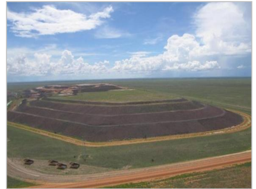
Rehabilitated waste rock stockpile Ernest Henry

At the exploration stage, core samples are taken to not only determine the level of mineralisation but to also assess the value of soil to support vegetation. Computer models are used to simulate mining and any necessary backfilling that may need to occur during the life of the mine.