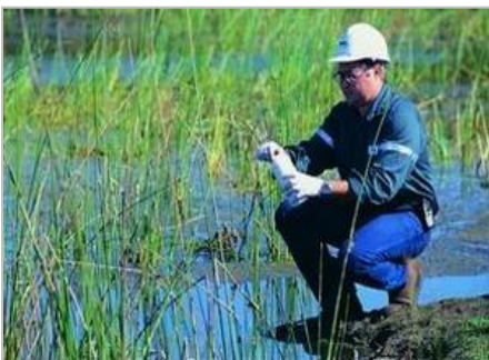
Water testing is conducted on site

Factors such as rainfall, winds, temperature range, pre-existing vegetation, ground water quality, soil