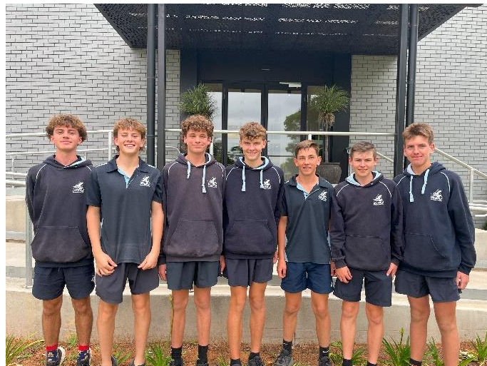
Year 8 Boys – absent in photo: Chase Russell