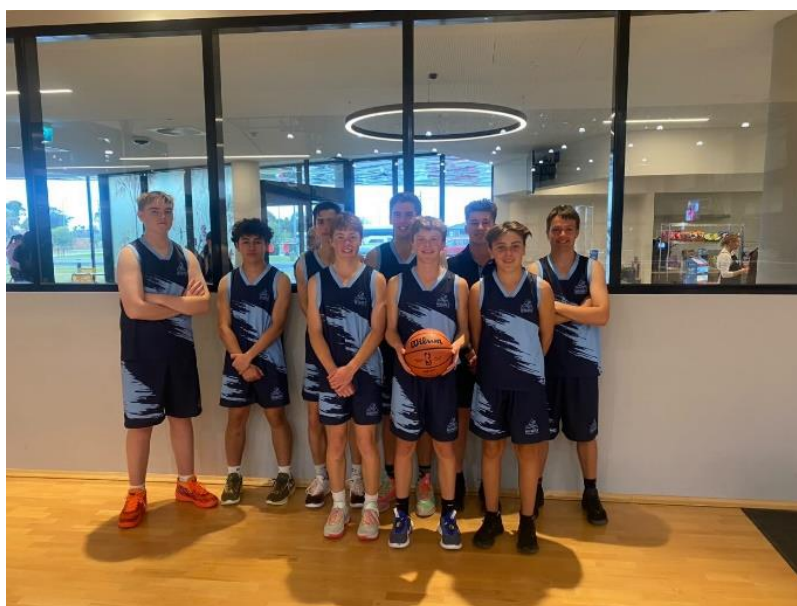
Year 9/10 Boys