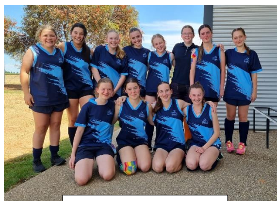
Intermediate Girls Team

Unfortunately, we missed our photo opportunity of the Junior Girls due to early collections on the day.