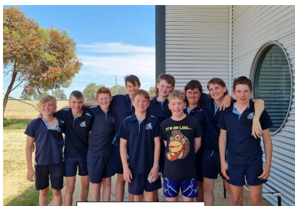
Junior Boys Team